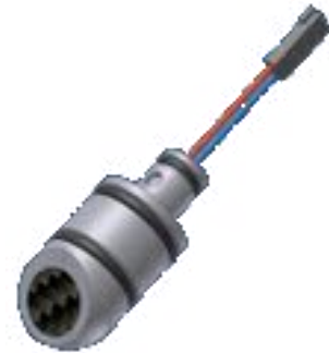
Figure 2: Spare transducer type MFATZ.x