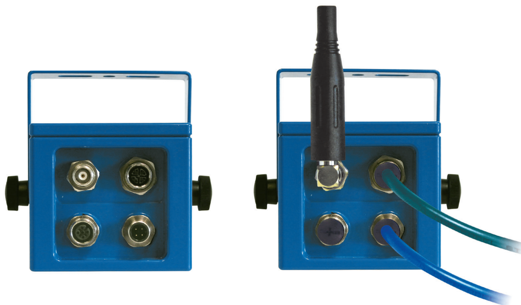
RugiCAM-IP module cable interface