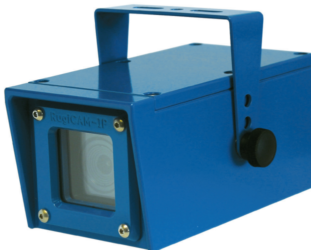
RUGICAM-IP camera unit