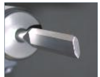
THIN PROFILE BLADE PREVENTS BUILD UP